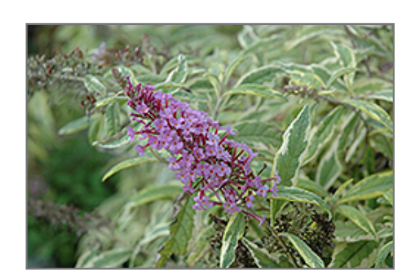
Strawberry Lemonade Butterfly Bush flowers