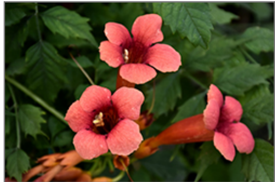
Flamenco Trumpetvine flowers

Flamenco Trumpetvine is a dense multi-stemmed deciduous woody vine with a twining and trailing habit of growth. Its average texture blends into the landscape, but can be balanced by one or two finer or coarser trees or shrubs for an effective composition.