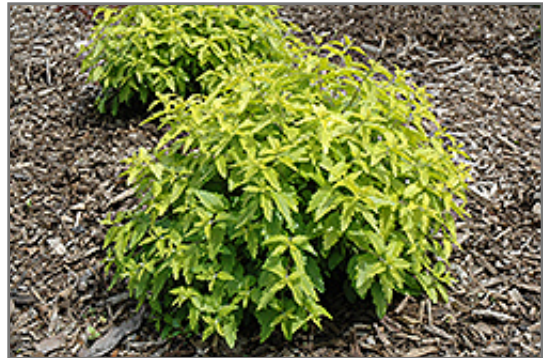
Sunshine Blue Caryopteris

Sunshine Blue Caryopteris is recommended for the following landscape applications;