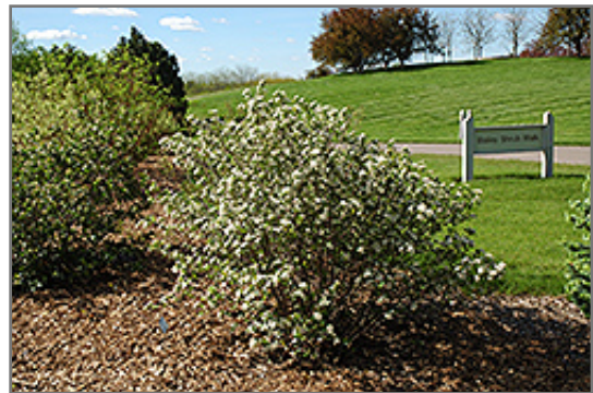
Autumn Magic Black Chokeberry in bloom