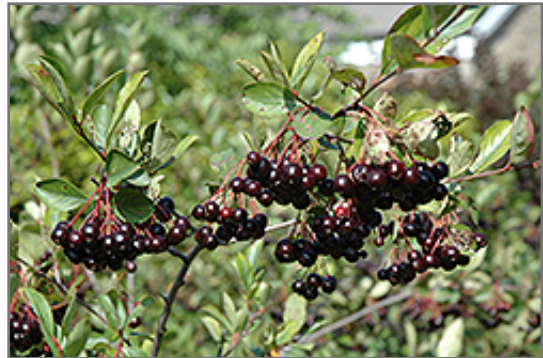
Autumn Magic Black Chokeberry fruit

Autumn Magic Black Chokeberry will grow to be about 4 feet tall at maturity, with a spread of 3 feet. It tends to be a little leggy, with a typical clearance of 1 foot from the ground. It grows at a slow rate, and under ideal conditions can be expected to live for approximately 20 years.