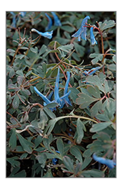
Blue Heron Corydalis flowers