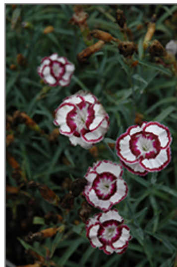
Raspberry Swirl Pinks flowers

This is a relatively low maintenance plant, and is best cleaned up in early spring before it resumes active growth for the season. It is a good choice for attracting bees and butterflies to your yard, but is not particularly attractive to deer who tend to leave it alone in favor of tastier treats. It has no significant negative characteristics.