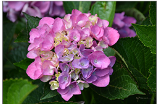
Cityline Venice Dwarf Hydrangea flowers