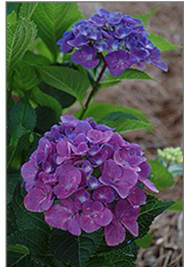
Cityline Venice Dwarf Hydrangea flowers

This shrub will require occasional maintenance and upkeep, and should only be pruned after flowering to avoid removing any of the current season's flowers. It has no significant negative characteristics.