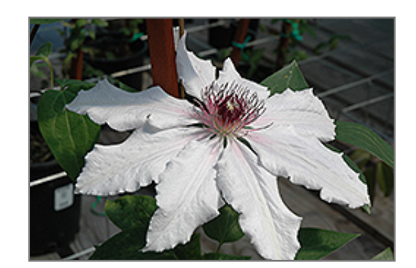
Snow Queen Clematis flowers