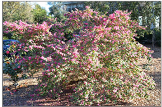
Razzleberri Fringeflower in bloom

This shrub does best in full sun to partial shade. It prefers to grow in average to moist conditions, and shouldn't be allowed to dry out. It is particular about its soil conditions, with a strong preference for rich, acidic soils. It is somewhat tolerant of urban pollution. Consider applying a thick mulch around the root zone in winter to protect it in exposed locations or colder microclimates. This is a selected variety of a species not originally from North America.