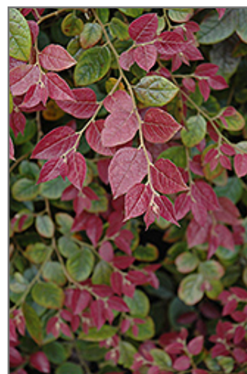
Razzleberri Fringeflower foliage