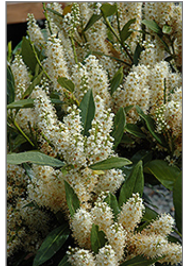
Dwarf English Laurel flowers