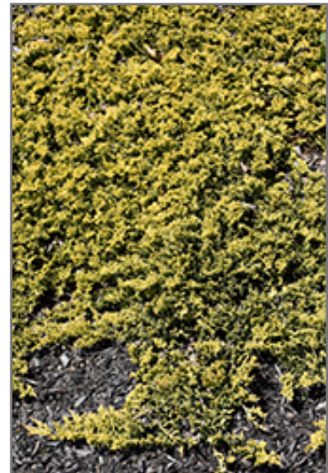
Mother Lode Juniper foliage