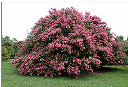
Seminole Crapemyrtle in bloom