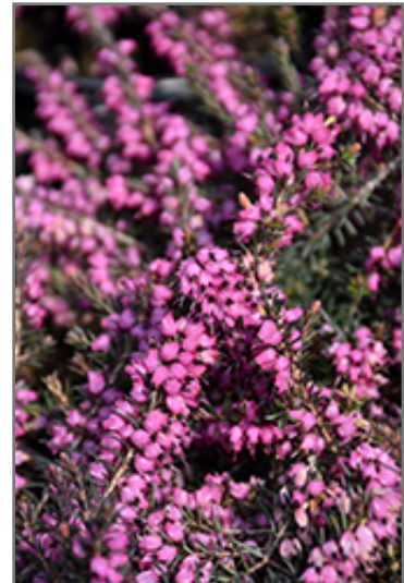
Springwood Pink Heath flowers

Springwood Pink Heath is recommended for the following landscape applications;