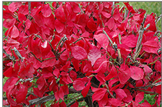
Compact Winged Burning Bush in fall