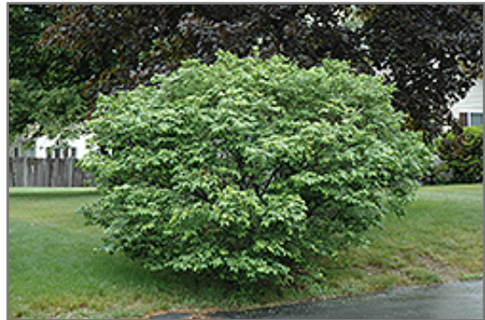
Compact Winged Burning Bush

Compact Winged Burning Bush will grow to be about 7 feet tall at maturity, with a spread of 7 feet. It tends to fill out right to the ground and therefore doesn't necessarily require facer plants in front, and is suitable for planting under power lines. It grows at a slow rate, and under ideal conditions can be expected to live for 50 years or more.