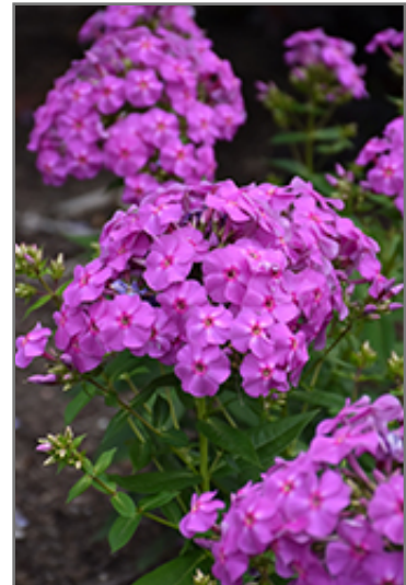
Flame Lilac Garden Phlox flowers