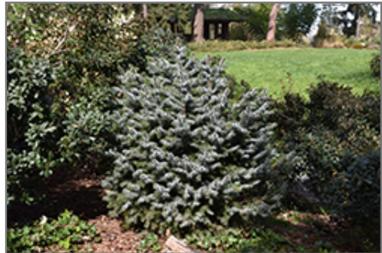
Papoose Dwarf Sitka Spruce

Papoose Dwarf Sitka Spruce is recommended for the following landscape applications;