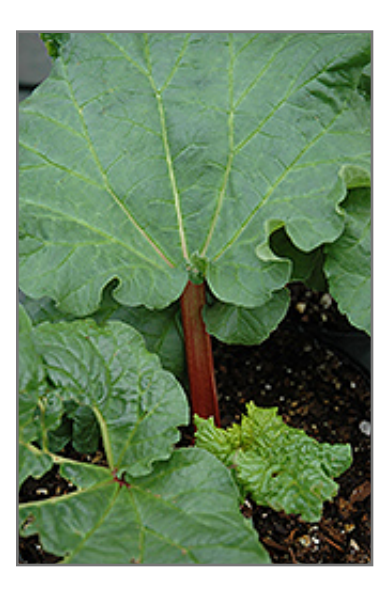
Crimson Cherry Rhubarb foliage

Crimson Cherry Rhubarb is primarily valued in the landscape or garden for its pronouncedly upright and towering form. It features bold spikes of creamy white flowers rising above the foliage from late spring to early summer. Its attractive large crinkled lobed leaves emerge chartreuse in spring, turning dark green in color throughout the season. The crimson stems are very colorful and add to the overall interest of the plant.