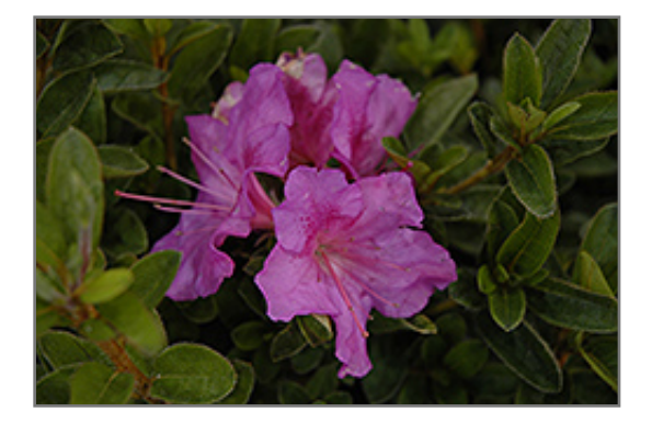
Encore Autumn Royalty Azalea flowers

Encore Autumn Royalty Azalea will grow to be about 4 feet tall at maturity, with a spread of 4 feet. It tends to be a little leggy, with a typical clearance of 1 foot from the ground. It grows at a slow rate, and under ideal conditions can be expected to live for 40 years or more.