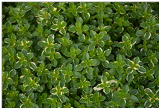
Variegated Broadleaf Thyme foliage