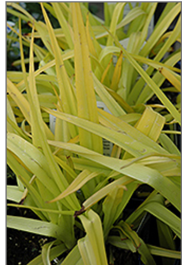
Sunshine Charm Spiderwort foliage

This is a relatively low maintenance plant, and is best cleaned up in early spring before it resumes active growth for the season. It is a good choice for attracting butterflies to your yard, but is not particularly attractive to deer who tend to leave it alone in favor of tastier treats. It has no significant negative characteristics.