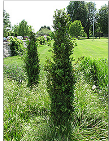
Graham Blandy Boxwood

Graham Blandy Boxwood is recommended for the following landscape applications;