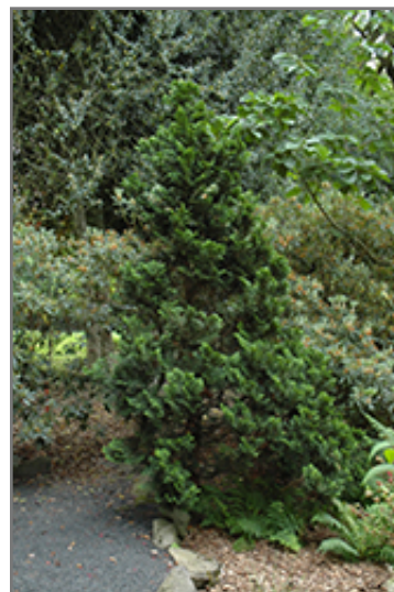
Nana Dwarf Hinoki Falsecypress

Nana Dwarf Hinoki Falsecypress is recommended for the following landscape applications;