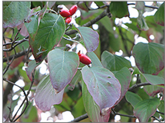
Cherokee Chief Flowering Dogwood fruit

This tree does best in full sun to partial shade. You may want to keep it away from hot, dry locations that receive direct afternoon sun or which get reflected sunlight, such as against the south side of a white wall. It requires an evenly moist well-drained soil for optimal growth, but will die in standing water. It is very fussy about its soil conditions and must have rich, acidic soils to ensure success, and is subject to chlorosis (yellowing) of the foliage in alkaline soils. It is quite intolerant of urban pollution, therefore inner city or urban streetside plantings are best avoided, and will benefit from being planted in a relatively sheltered location. Consider applying a thick mulch around the root zone in winter to protect it in exposed locations or colder microclimates. This is a selection of a native North American species.