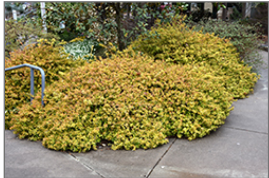
Kaleidoscope Abelia