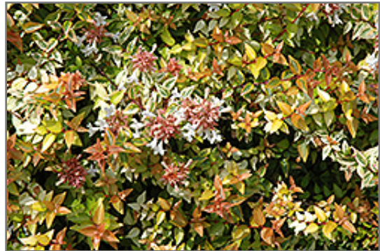
Kaleidoscope Abelia flowers

Kaleidoscope Abelia is a multi-stemmed evergreen shrub with a mounded form. Its average texture blends into the landscape, but can be balanced by one or two finer or coarser trees or shrubs for an effective composition.