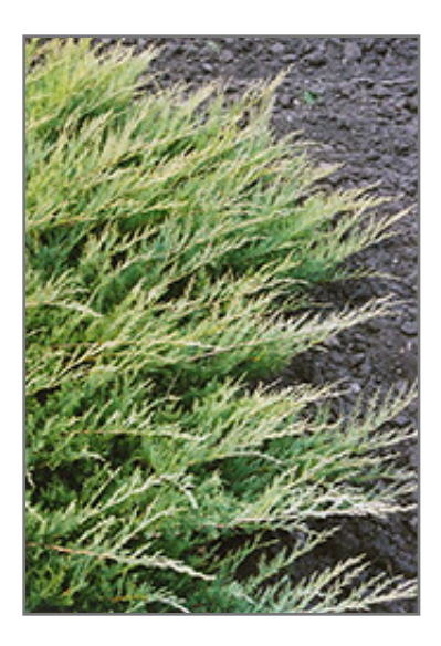
Broadmoor Juniper foliage