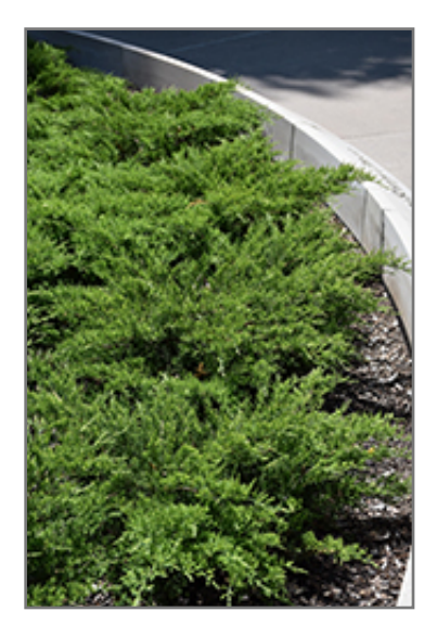
Broadmoor Juniper