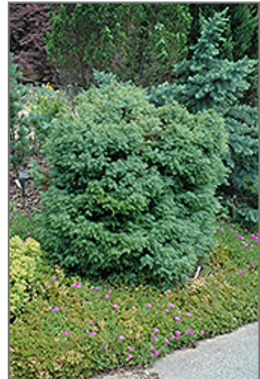
Mushroom Japanese Cedar