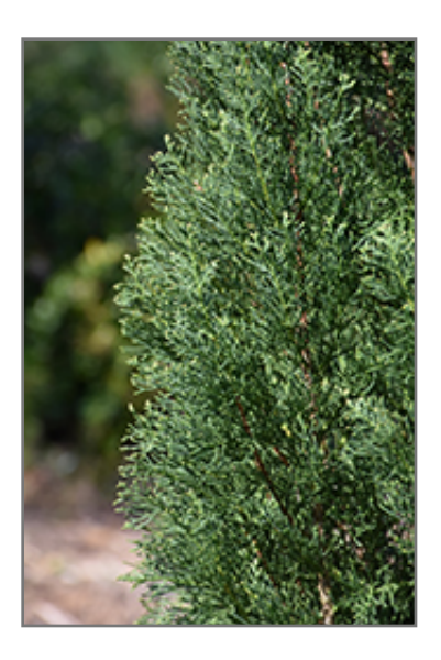
Blue Italian Cypress foliage