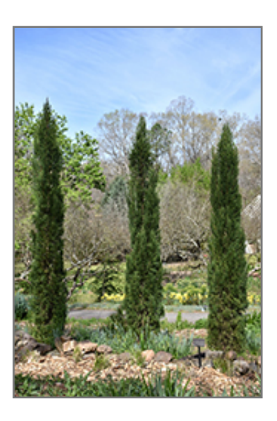
Blue Italian Cypress