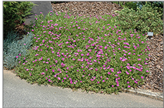
Purple Ice Plant in bloom

Purple Ice Plant will grow to be only 2 inches tall at maturity extending to 3 inches tall with the flowers, with a spread of 24 inches. Its foliage tends to remain low and dense right to the ground. It grows at a fast rate, and under ideal conditions can be expected to live for approximately 5 years. As an evergreen perennial, this plant will typically keep its form and foliage year-round.