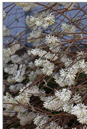
Oriental Paper Bush flowers

This is a relatively low maintenance shrub, and should only be pruned after flowering to avoid removing any of the current season's flowers. Gardeners should be aware of the following characteristic(s) that may warrant special consideration;