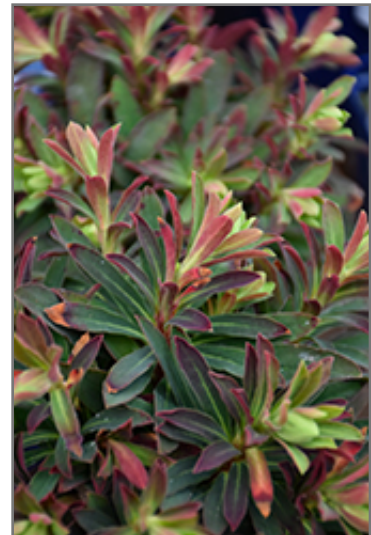
Tiny Tim Spurge flowers