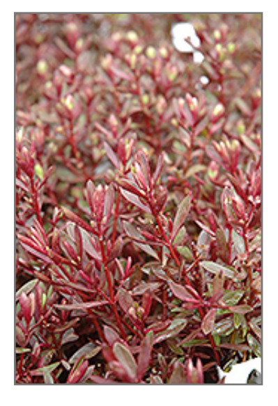
Caledonia Hebe foliage