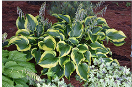
Atlantis Hosta