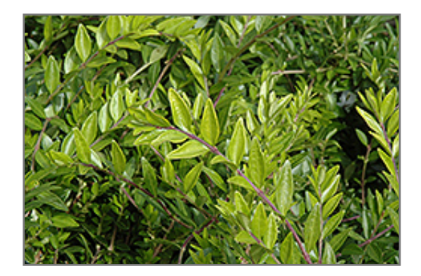
Royal Carpet Privet Honeysuckle foliage