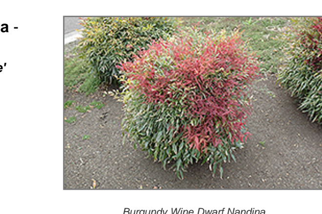
Burgundy Wine Dwarf Nandina