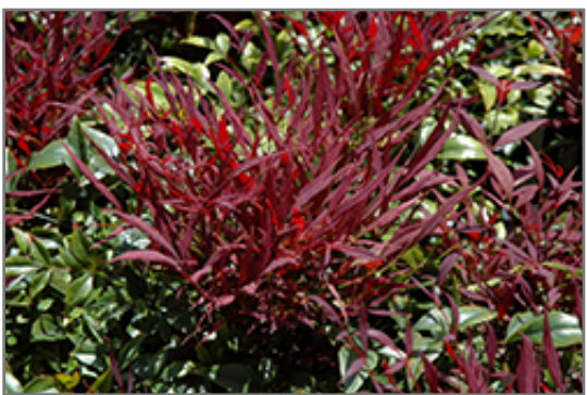
Burgundy Wine Dwarf Nandina foliage