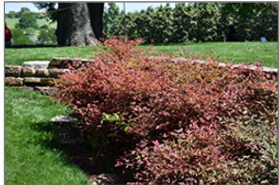
Flirt Nandina

Flirt Nandina is recommended for the following landscape applications;