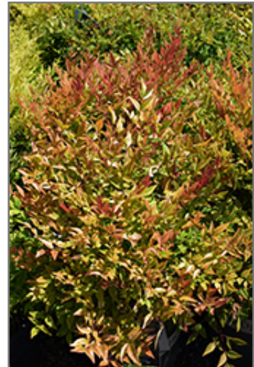
Gulf Stream Dwarf Nandina

This shrub performs well in both full sun and full shade. However, you may want to keep it away from hot, dry locations that receive direct afternoon sun or which get reflected sunlight, such as against the south side of a white wall. It does best in average to evenly moist conditions, but will not tolerate standing water. It is not particular as to soil type or pH. It is highly tolerant of urban pollution and will even thrive in inner city environments. This is a selected variety of a species not originally from North America.