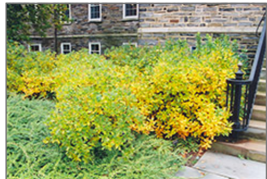
Summersweet in fall