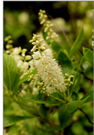
Summersweet flowers