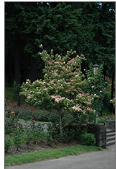
Heart Throb Chinese Dogwood in bloom