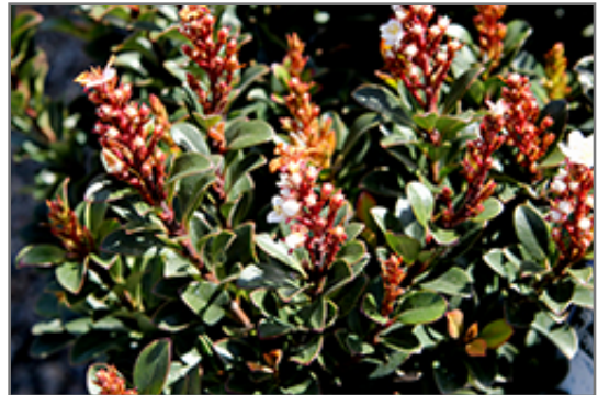
Dwarf Yeddo Hawthorn flowers

This shrub does best in full sun to partial shade. It prefers to grow in average to moist conditions, and shouldn't be allowed to dry out. It is not particular as to soil type or pH. It is somewhat tolerant of urban pollution. This is a selected variety of a species not originally from North America.