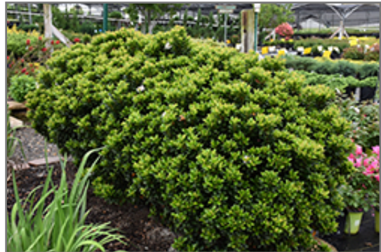
Dwarf Yeddo Hawthorn

This is a relatively low maintenance shrub, and should not require much pruning, except when necessary, such as to remove dieback. It is a good choice for attracting birds to your yard. It has no significant negative characteristics.