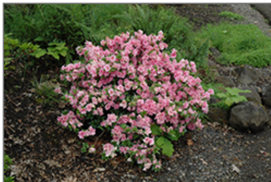
Gumpo Pink Azalea in bloom