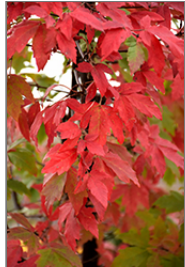
Paperbark Maple in fall

This tree does best in full sun to partial shade. It prefers to grow in average to moist conditions, and shouldn't be allowed to dry out. It is not particular as to soil type or pH. It is somewhat tolerant of urban pollution. This species is not originally from North America.