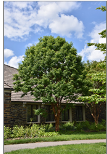
Paperbark Maple