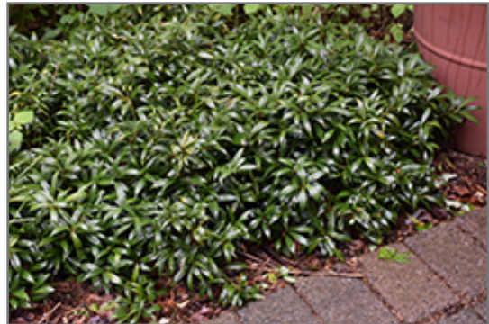
Himalayan Sweet Box

Himalayan Sweet Box is recommended for the following landscape applications;