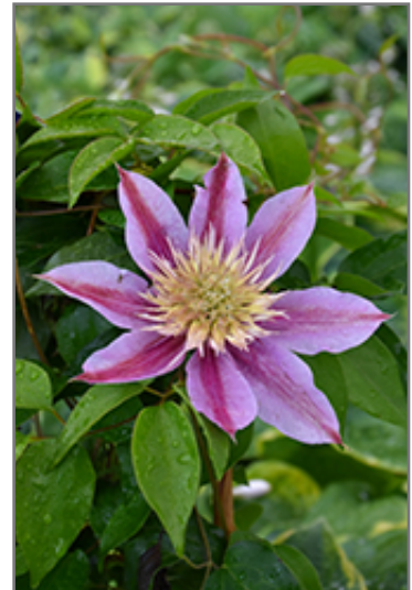
Empress Clematis flowers

Empress Clematis is recommended for the following landscape applications;