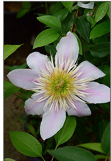
Empress Clematis flowers

* This is a 'special order' plant - contact store for details