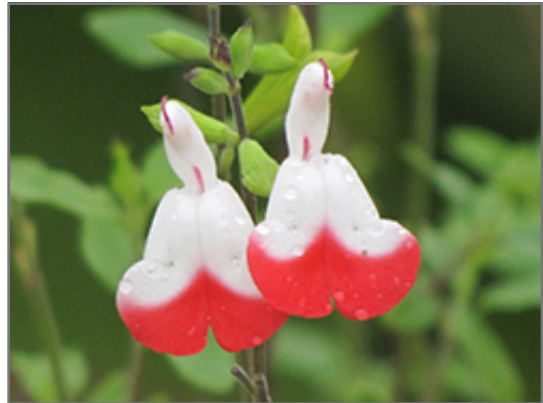
Hot Lips Sage flowers

Hot Lips Sage is an herbaceous evergreen perennial with an upright spreading habit of growth. Its relatively fine texture sets it apart from other garden plants with less refined foliage.