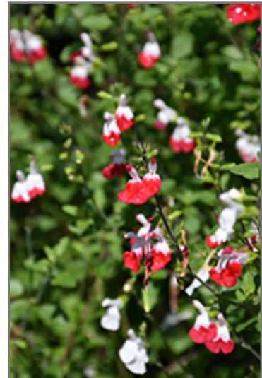
Hot Lips Sage flowers

Hot Lips Sage is a fine choice for the garden, but it is also a good selection for planting in outdoor pots and containers. With its upright habit of growth, it is best suited for use as a 'thriller' in the 'spiller-thriller-filler' container combination; plant it near the center of the pot, surrounded by smaller plants and those that spill over the edges. It is even sizeable enough that it can be grown alone in a suitable container. Note that when growing plants in outdoor containers and baskets, they may require more frequent waterings than they would in the yard or garden.