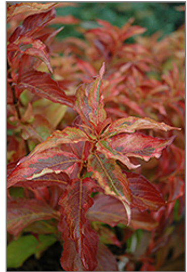
My Monet Sunset Weigela in fall

My Monet Sunset Weigela makes a fine choice for the outdoor landscape, but it is also well-suited for use in outdoor pots and containers. It is often used as a 'filler' in the 'spiller-thriller-filler' container combination, providing a mass of flowers and foliage against which the thriller plants stand out. Note that when grown in a container, it may not perform exactly as indicated on the tag - this is to be expected. Also note that when growing plants in outdoor containers and baskets, they may require more frequent waterings than they would in the yard or garden.