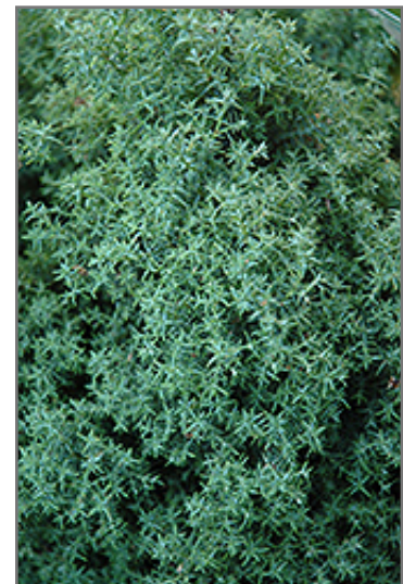
Blue Feathers Hinoki Falsecypress foliage