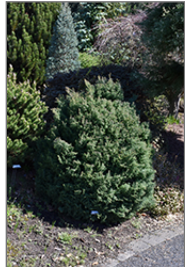
Blue Feathers Hinoki Falsecypress

Blue Feathers Hinoki Falsecypress is recommended for the following landscape applications;