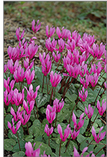
Purple Cyclamen flowers

Purple Cyclamen is recommended for the following landscape applications;