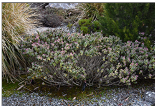
Silver Dollar Hebe