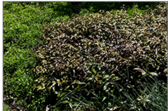
Scarletta Fetterbush