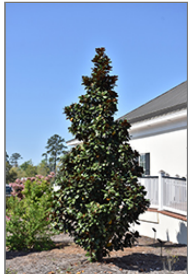
Teddy Bear Magnolia