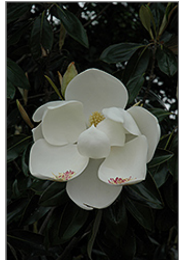
Teddy Bear Magnolia flowers